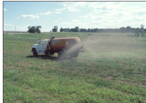
A manure slurry is applied to this field to help manage the animal waste and to add nutrients to the soil.