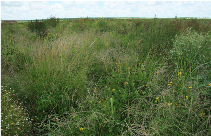
Figure 6. A diverse native plant pasture.