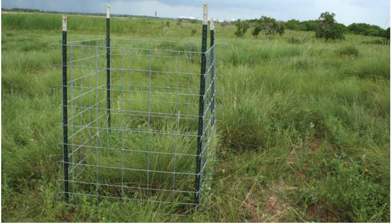
Figure 2. Grazing enclosures allow landowners to monitor grazing pressure by livestock.