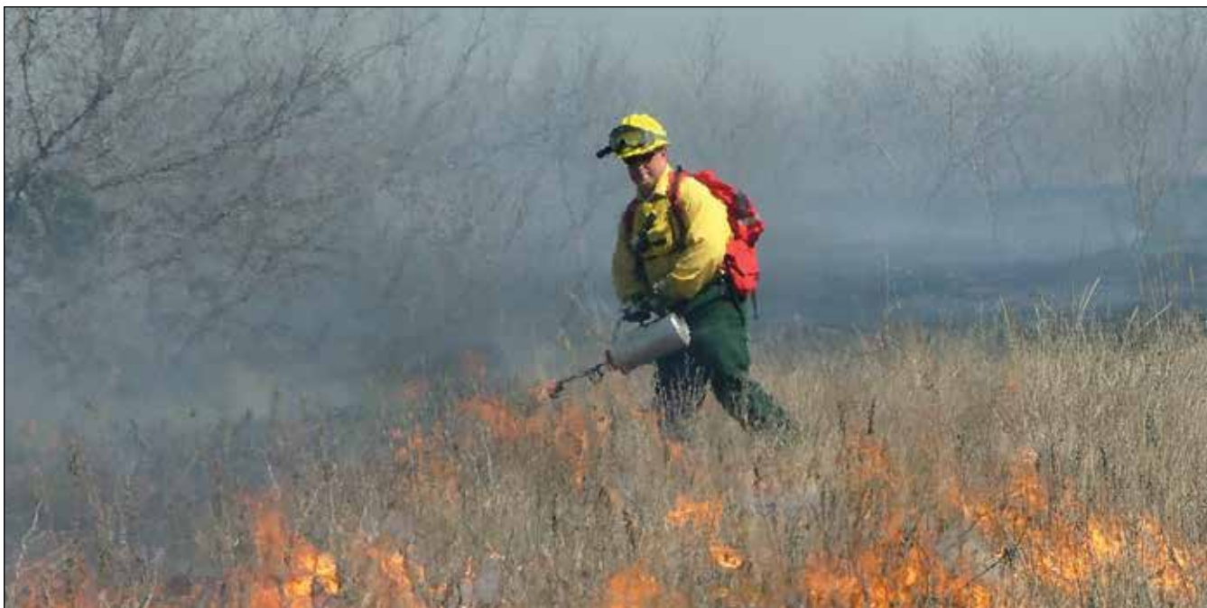
Figure 9. Prescribed burning provides numerous benefits to the land and is very cost effective.

trayed fire as destructive and unnecessary. This was due to a lack of knowledge and understanding of the benefits of fire to plant communities. Wildfires can grow out of control and create dangerous situations and undesirable effects, whereas prescribed burns follow guidelines that establish the conditions and manner under which fire will be applied on a specific area to accomplish specific management and ecological objectives (Figure 9).