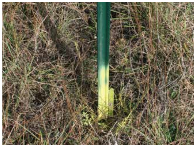
Figure 1. Marking the base of a photo point with spray paint will help monitor erosion over time.

Land managers should conduct activities that will improve land productivity by reducing erosion, promote greater rainfall infiltration, slow the rate of invasion by undesirable species, and sustain the land during times of drought (McGinty and White, 2000). One can evaluate the success of a project by monitoring wildlife populations, but without understanding the reasons why they are increasing or decreasing, a land manager cannot make informed decisions for future management. Therefore, based on the stated goals for the restoration project, monitoring the plant communities will help provide more definitive results. When developing a monitoring and management program, it is essential to base the techniques used on the initial restoration goals to also fit your specific land management goals (Masters, 1997).