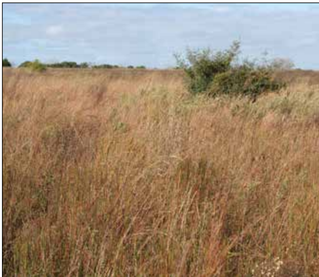
Figure 16. Grasses tend to dominate over time, as pictured above, and cattle can be used to control grass growth and allow forbs to grow.

The best time of year to disk is December – February. There is no need to disk an entire field, as strips 20 feet wide and 100 yards long will greatly benefit deer, quail, and wild turkey. It is best to disk strips close to cover, such as brush mottes, forested areas, or an area with numerous bunchgrass clumps. This will allow quail and other species to forage the disked area for food and quickly return to the cover areas to escape predators.