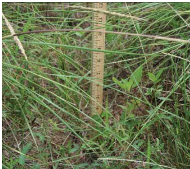
Figure 5. Measuring grass stubble height can serve as an “early warning system” to move cattle or determine if grass height is sufficient for nesting cover.