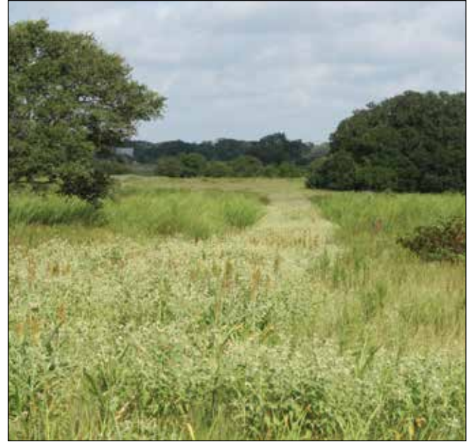
Figure 15. Disked areas can save landowners money by acting as natural food plots.

Landowners can also disk strips throughout the field to reduce grass dominance and promote movement within the field. Disked strips provide an additional benefit as they can act as firelines for landowners using prescribed burning to enhance wildlife habitat (Figure 11).