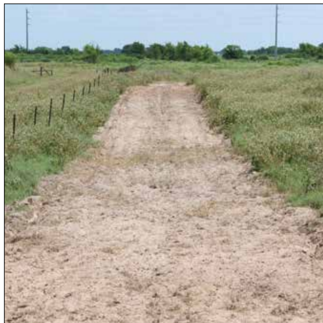
Figure 11. Disking along fencelines acts as a firebreak and can be a natural food plot once forbs germinate in the disked area.

Fire type is another consideration that must be taken into account depending on burn objectives (Figure 10). Headfires move in the same direction as the wind, resulting in a faster rate of spread, greater flame heights, and more effectiveness at top-killing shrubs and trees. Backfires move against the wind, so that they consume more fuel and create greater basal damage to woody species than headfires. In many situations, firelines will need to be constructed to ensure safety and containment of the burn. Firelines can be constructed using mechanical methods such as disking or using a blade to knock down vegetation to mineral soil (Figure 11). Also, using fire retardants or water to soak the vegetation can be used for fireline construction immediately prior to initiating the fire. Costs for prescribed burning will range from 50 cents to $10 per acre or more depending on fireline construction and if the landowner contracts the job with professionals. Also, costs should decrease with subsequent burns.