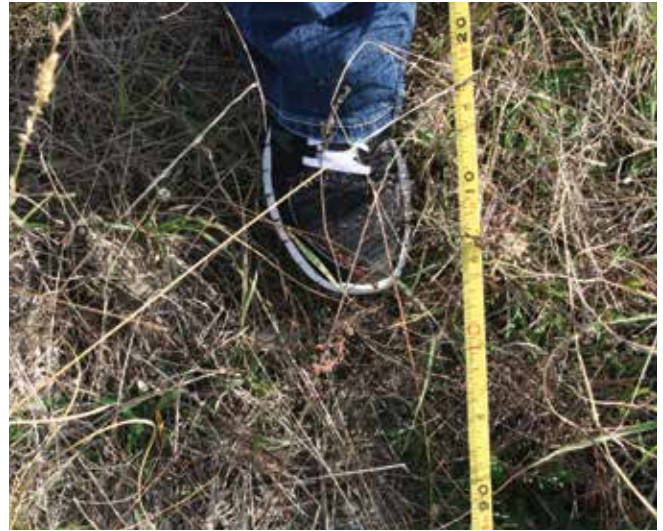
Figure 4. Record whether forbs, grass, brush canopy, or bare ground is present at the tip of your shoe every other step during a cover survey.