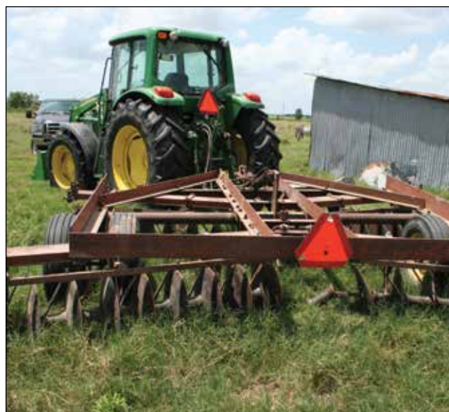
Figure 14. Disking implements can be used to break up the top 2-4 inches of soil.

Prescribed burning and grazing management are preferred methods for maintaining native grasslands, although there are situations where burning and grazing may not be feasible and shredding may be a suitable alternative to enhance species diversity (Figure 13; Knapp et al. 1999). Shredding is not a desirable method for brush control. However, it may be necessary the first 2-3 years after seeding to reduce competition from annual forbs and undesirable grasses (Dillard, 2000). Deck heights should be set at a minimum height of 4 inches, but higher settings are preferred to maintain adequate cover and reduce moisture loss from the soil that is needed for grass seedlings to grow. Shredding is not a preferred method for managing wildlife habitat as it can create a deep thatch layer at the ground level that is more difficult for bobwhite chicks to travel through and can prevent seedlings from receiving sunlight. If shredding must be done, do so in February to provide cover during fall and early winter and to avoid disrupting critical nesting and reproductive periods in spring and early summer (Harper, 2007). Shredding