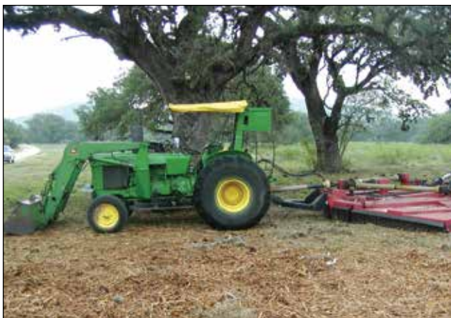
Figure 13. Shredding is not a preferred method of brush control, but may allow enough time for grass to grow and provide fuel for prescribed burning.

The landowner conducting the prescribed burn is legally responsible for unintended damage. However, according to the Texas Prescribed Burning Act passed in 1999, if a certified prescribed burn manager conducts the burn and has at least $1 million in liability insurance coverage, the burn manager is held liable for damages, not the landowner. The best thing to do is work with your neighbors to keep them informed of your activities. Texas Commission on Environmental Quality (TCEQ) regulations state that burning must be downwind of or at least 300 feet from any structures unless written approval is obtained from the owner. It is also prudent to increase the liability coverage of your insurance. To protect yourself as much as possible, develop a detailed prescribed burn plan with a local burn manager who has experience in burning. Also, consider joining a local prescribed burn association. These “neighbor-helping-neighbor” organizations provide much needed expertise, equipment, and “boots on the ground” to help conduct a safe and effective fire. Communicate with the local authorities to keep them informed of your activities.