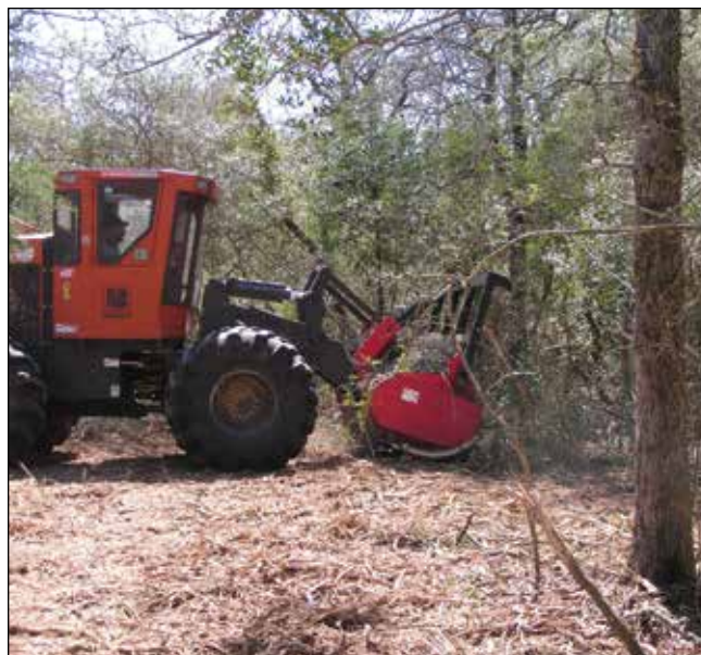
Figure 7. Mechanical brush treatments have the immediate effect of reduced canopy cover, but can cause significant soil disturbance and some species will vigorously resprout. A rotary mulcher is pictured here.

Introduced grass monocultures are often undesirable when managing for wildlife because they reduce the