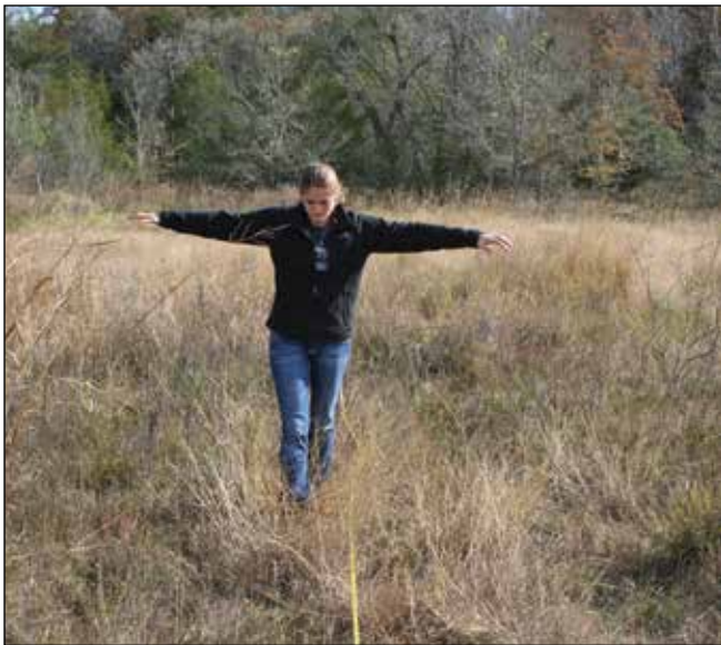
Figure 3. Walking a transect line with outstretched arms will allow you to evaluate nest clumps in an area of 0.1 acre.