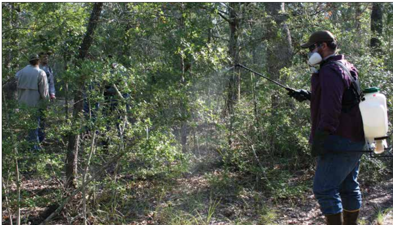
Figure 8. Chemical brush treatments are more selective than mechanical methods for reducing brush cover without disturbing the soil.

cal treatment methods can be used for effective brush management.