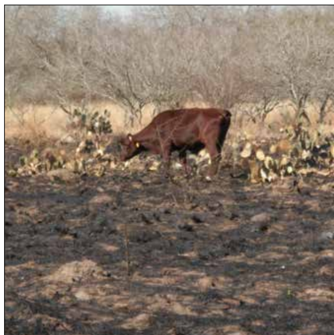
Figure 12. Exclude livestock from grazing burned areas for 60 to 90 days to prevent damaging plants.

Plant response after burning is highly dependent on rainfall, but in general, livestock should not be allowed to graze for 60 to 90 days after burning with average rainfall to prevent damaging the plants (Figure 12; Hanselka, 2009).