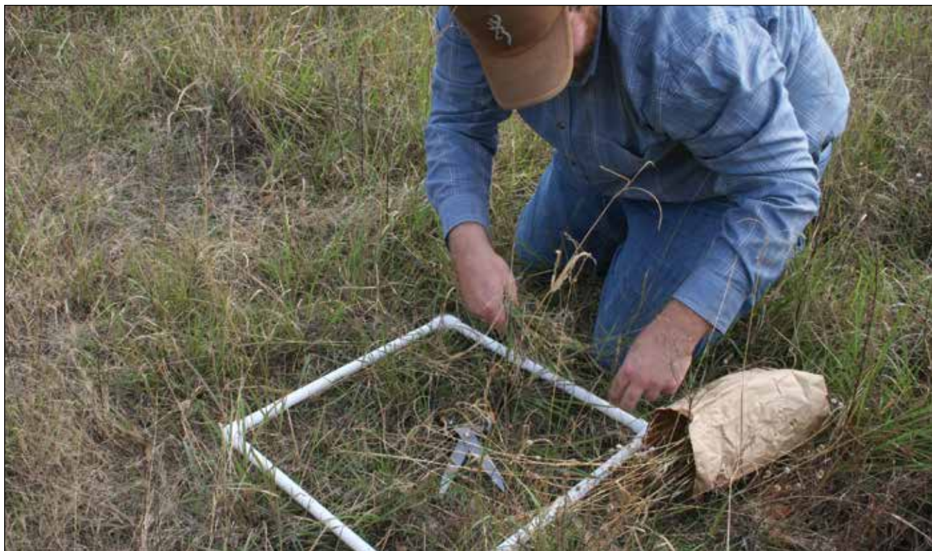
Figure 6. Use shears to clip plants to the ground within a plot frame to measure forage production.