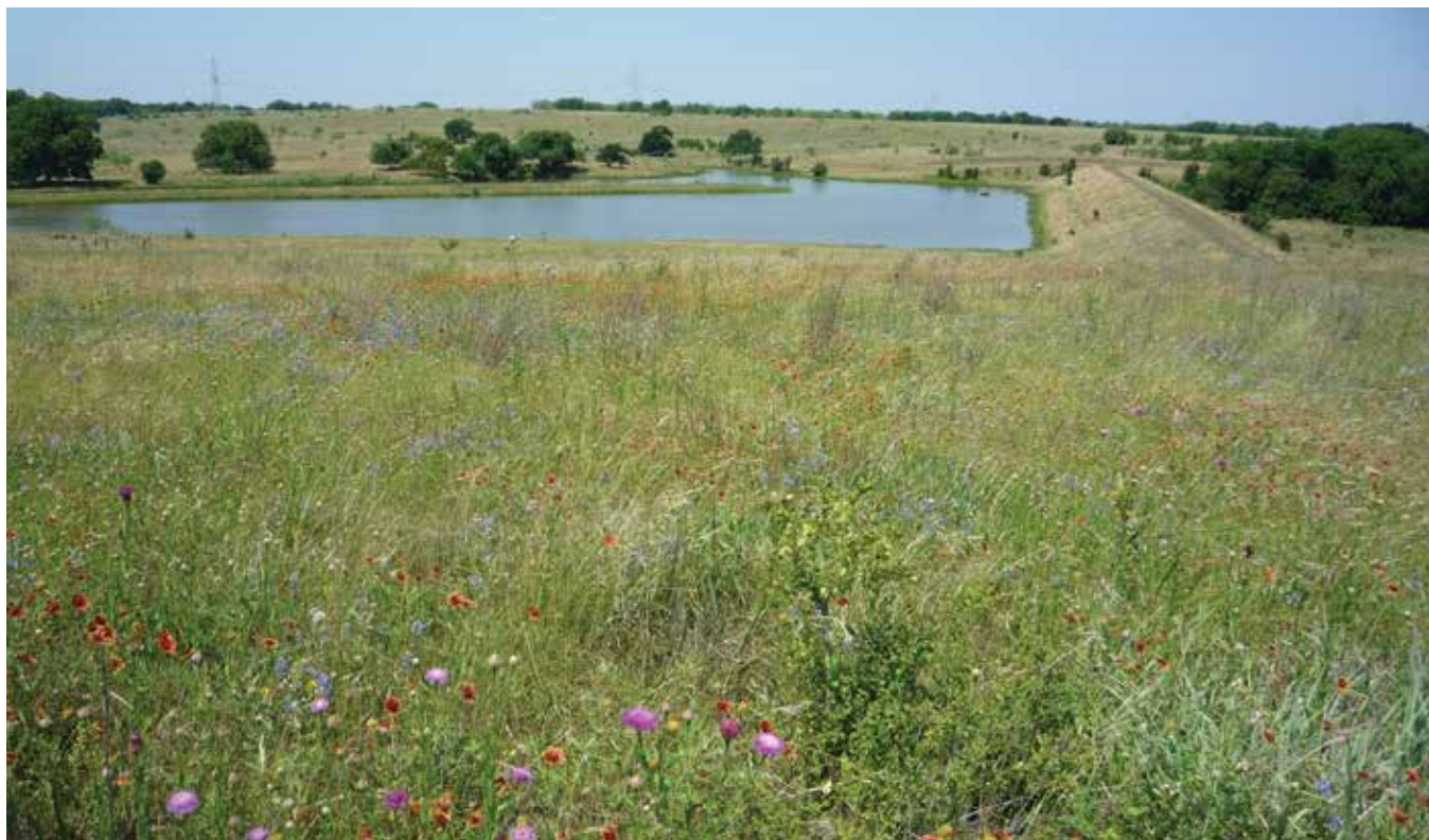
Native grasslands provide many benefits, including wildlife habitat, livestock forage, and watershed protection.